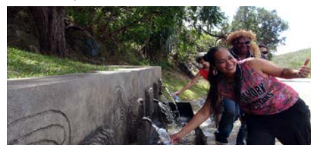
Public spring water