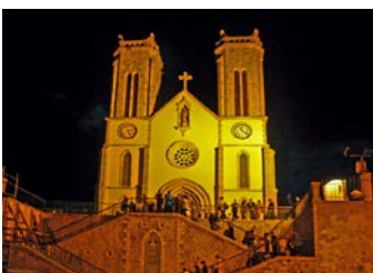
St Joseph's Cathedral

Adults: 1,000 XPF Under 18 & SENIORS 500 XPF Credit cards accepted