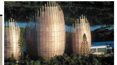
Tjibaou Cultural Centre

Adults: 200 XPF Seniors & children up to 18 100 XPF Local cash only