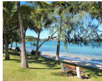
Anse Vata beach

Tour guests will be fascinated by stories of Melanesian customs