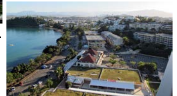
Bay of Lemons