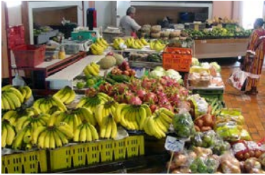
Noumea markets (except Mondays)

Bottled water and traditional bougna lunch with Fernando's Melanesian family are included in this tour