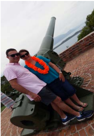
World War II canon

The traditional tasting is the highlight of every Fernando Tourisme tour of Noumea. Relax in the company of a Melanesian family. Savour Bougna, with meat and vegetables steamed in coconut milk on hot stones, island fruits and typical French pastries and cheese. Wash it down with French wines and New Caledonian beer or soft drinks.