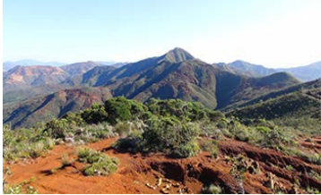
Southern mountains rich in minerals