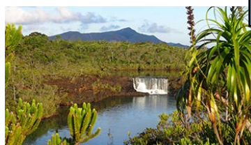
Madeleine falls and environmental reserve