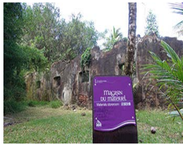
Ruins of penal colony of Prony

The former logging camp of Prony became a French penal colony where habitual offenders were sent to cut timber and suffer horrendous tortures which were the subject of a failed judicial inquiry in 1880. Minerals were ripped out of the mountains around Prony to feed the Broken Hill mills of Australia in the mid 20th century.