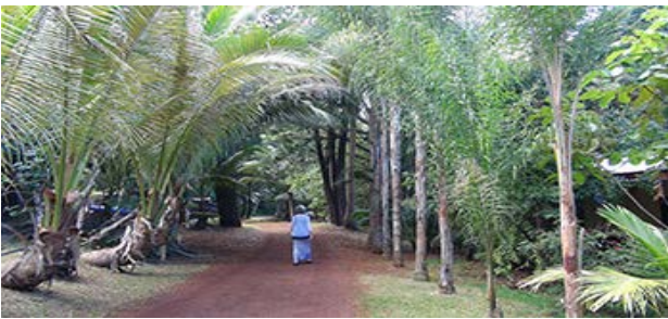
Historic avenue of Prony