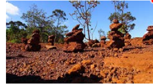
Tribal territory symbols

Admission charges to museums or cultural attractions are not included in the tour cost.