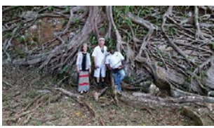
Giant banyan tree recovers its territory

The former logging camp of Prony became a French penal colony where habitual offenders were sent to cut timber and suffer horrendous tortures which were the subject of a failed judicial inquiry in 1880. Minerals were ripped out of the mountains around Prony to feed the Broken Hill mills of Australia in the mid 20th century.