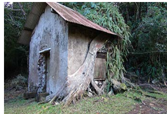
Banyan tree smotheres the accountant's quarters