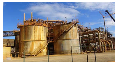
Nickel giants experiment with new mineral processes