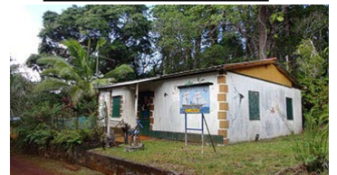
Abandoned penal colony and logging village